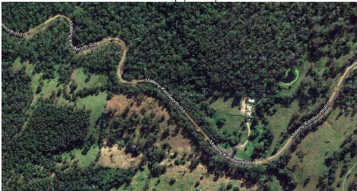
Bellbird Creek location