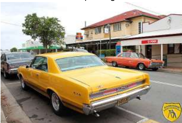
Kenilworth Street parking