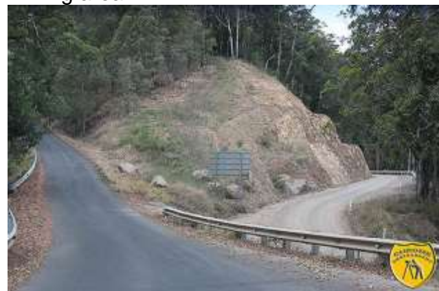
Obi Obi Road