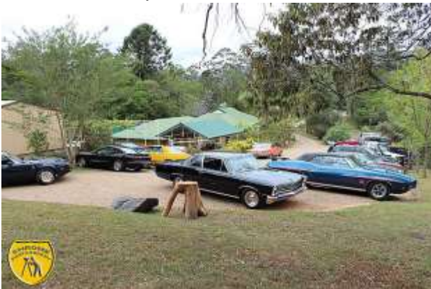
Bellbird Creek back parking