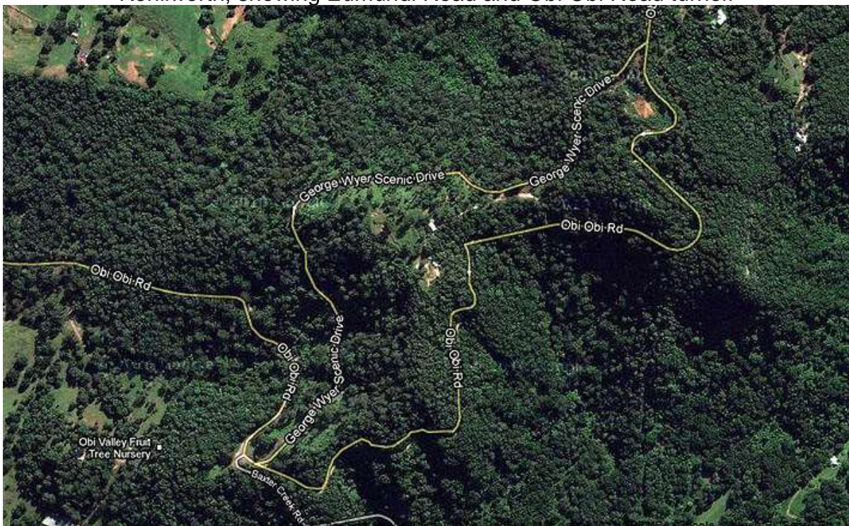
Obi Obi Range, up road (all sealed) at top