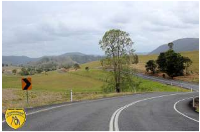
Conondale to Kenilworth