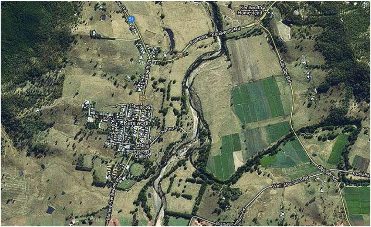
Kenilworth, showing Eumundi Road and Obi Obi Road turnoff