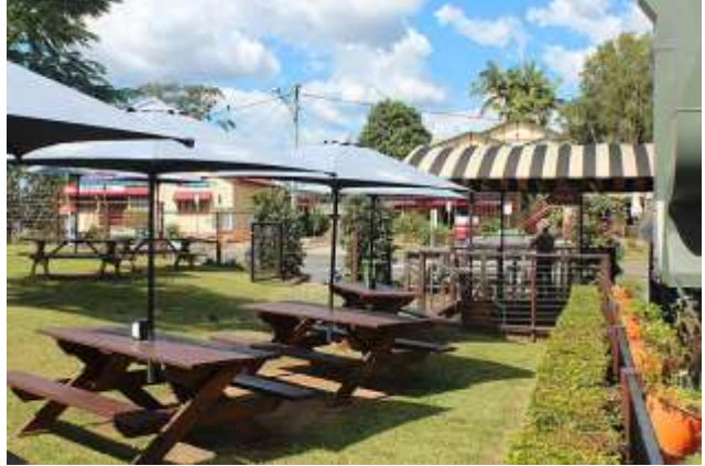
Courtyard looking to Margaret Street