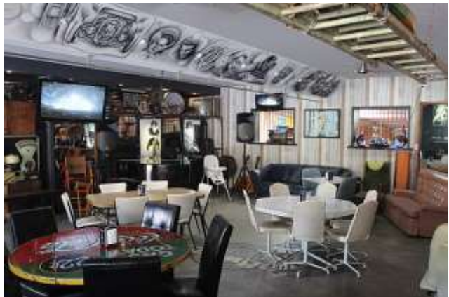
Function room next door