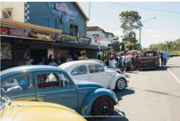
Bugs out front