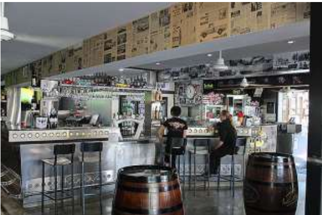
Bar (original diner)