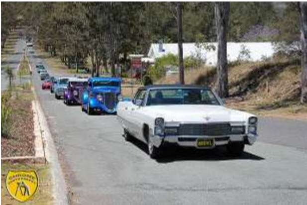
Approaching T Jct in Kooralbyn