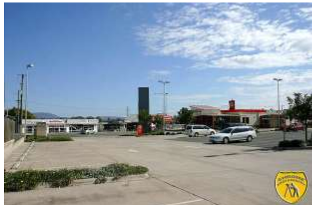
HJ/ Aldi carpark Beaudesert