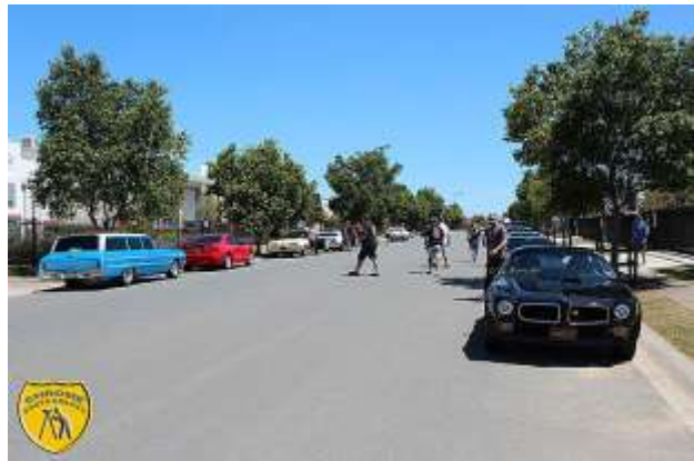
Yatala meet point Access Avenue (2016)