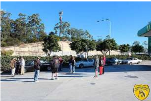
BP Regents Park (assemble at side)