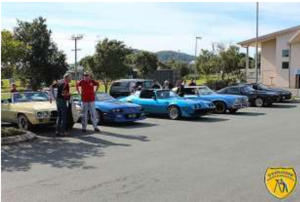
Beenleigh Tavern meet point (2017)