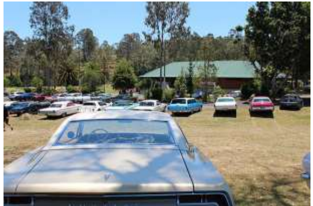
Parking at the Pavilion (lots)