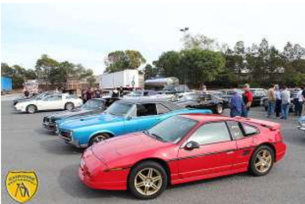
Burpengary meet point