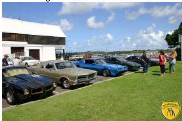
Reserved parking down side