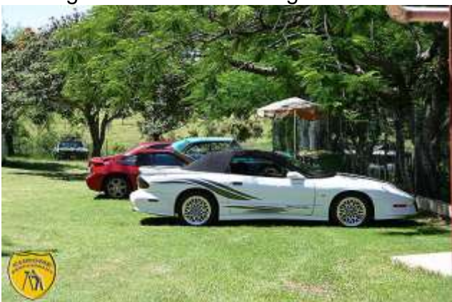
Parking in Pub yard