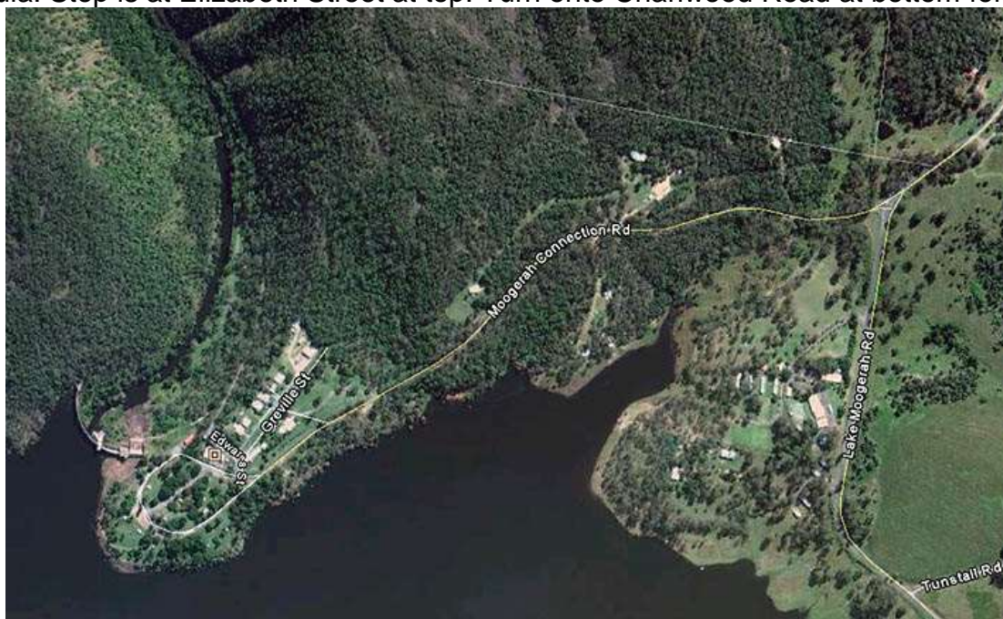
Lake Moogerah (Haigh Park)

Aratula. Stop is at Elizabeth Street at top. Turn onto Charwood Road at bottom for Dam