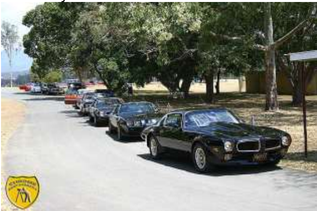
Moogerah Dam centre road Haigh Park