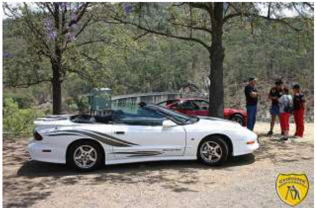
Near Dam Wall