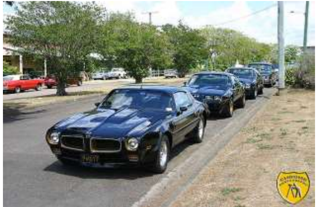
Elizabeth Street Aratula