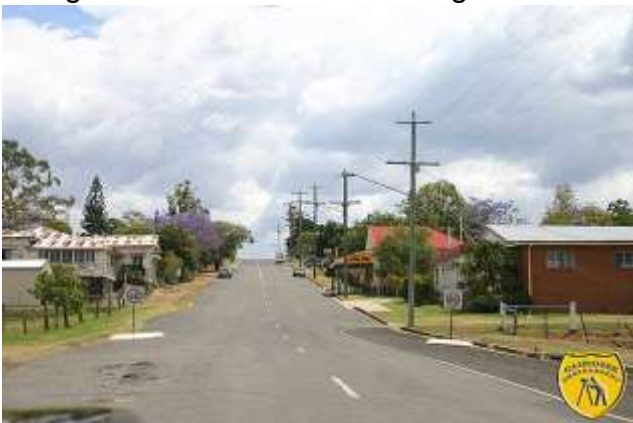
Arriving Roadvale. Pub on right