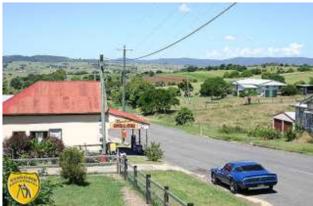
View from Pub