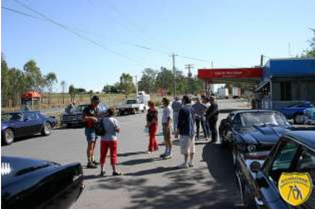
Amberley Meet Point