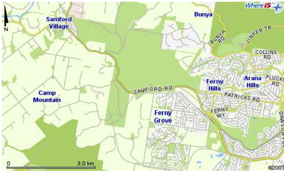
Kepperra to Samford