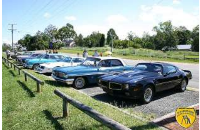
Station Street, Samford