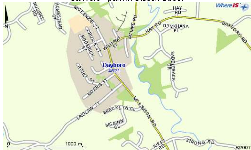
Dayboro' - park off Williams Street at Tourist Info Centre (on left)