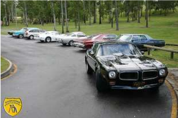
Keperra start point