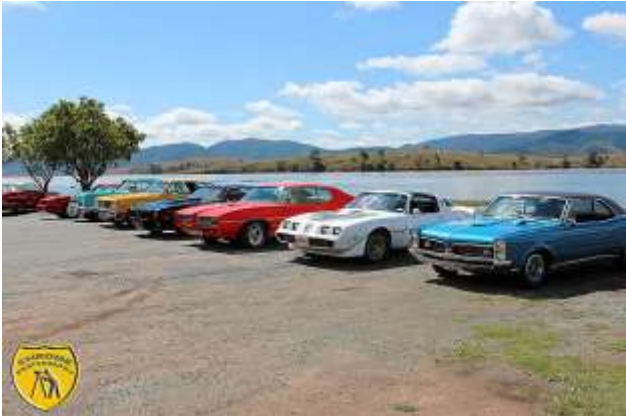
Cars at end of Peninsula