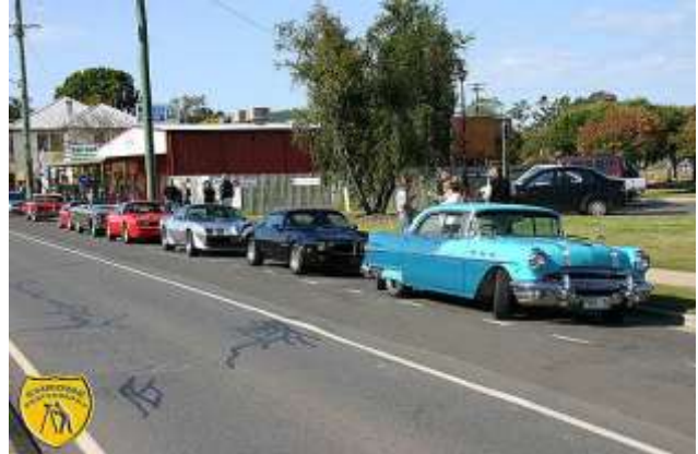
Esk main street