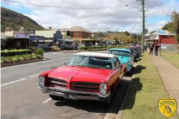
Esk main street