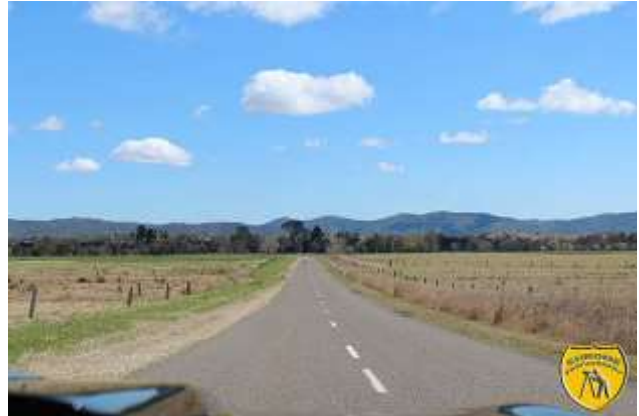
Mount Beppo Road near Toogoolawah