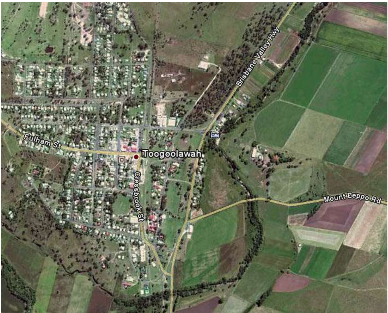
Toogoolawah showing Mount Beppo Road coming in from east. Pub is on corner of Cressbrook and Fulham, the main intersection in Town.