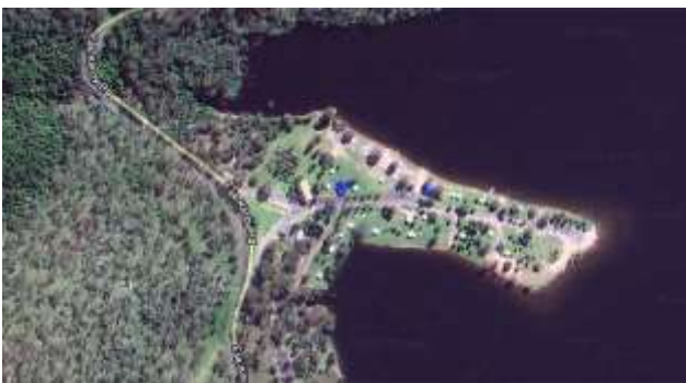
Somerset Dam Peninsula area