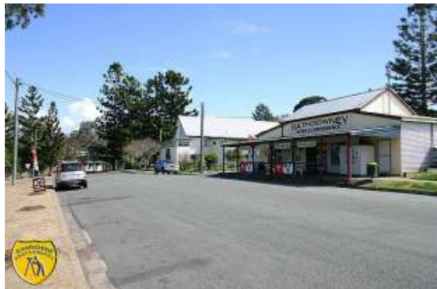
Rathdowney News & Convenience