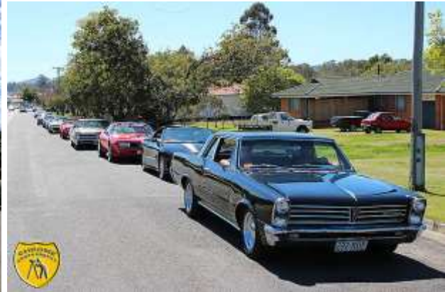
Regroup point up from Beaudesert lights