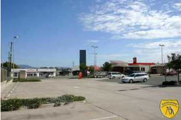
HJ/ Aldi carpark Beaudesert