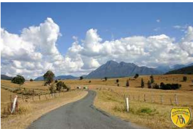
Barney View Road