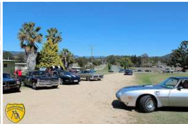
Bowls Club carpark, looking south