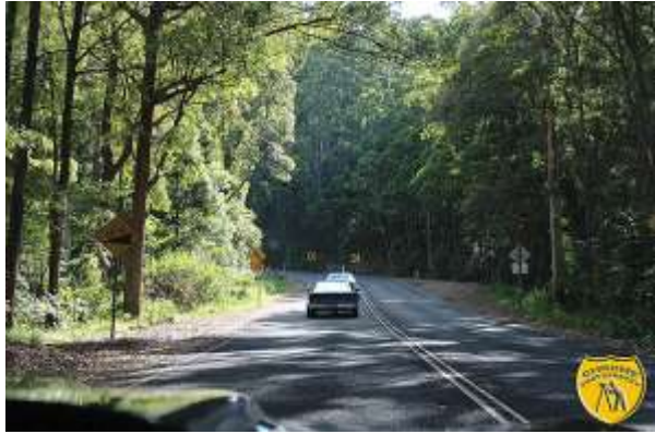
Mt Glorious Road uphill