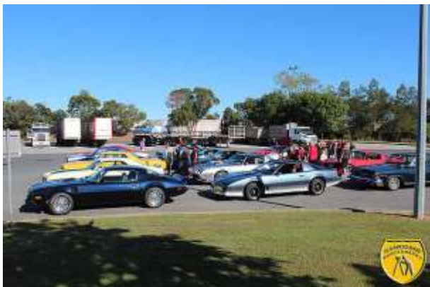
Burpengary meet point