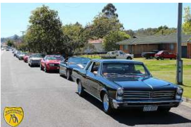
Regroup point up from Beaudesert lights