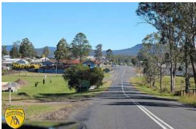
Woodenbong, pub on left