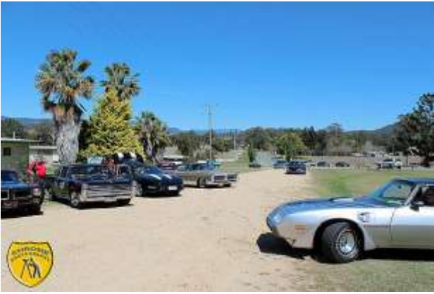
Bowls Club carpark, looking south