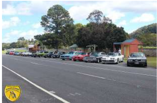
Mooball opposite side parking