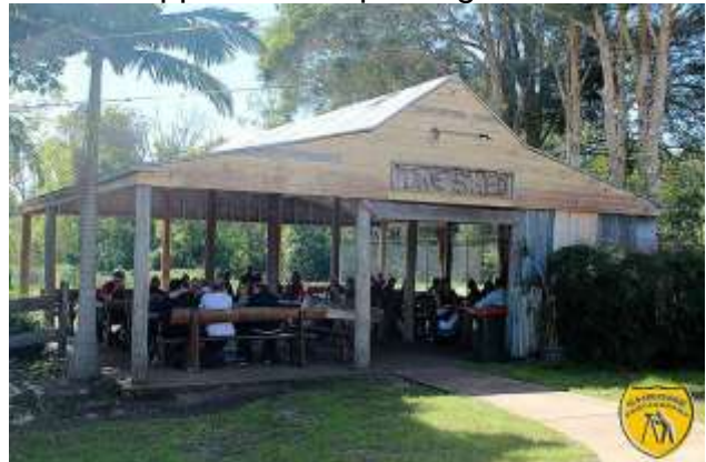
Billinudgel Pub outdoor shed at back