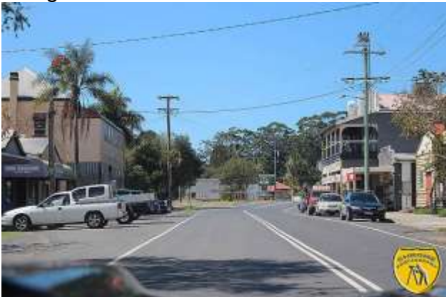
Billinudgel Pub (on left)