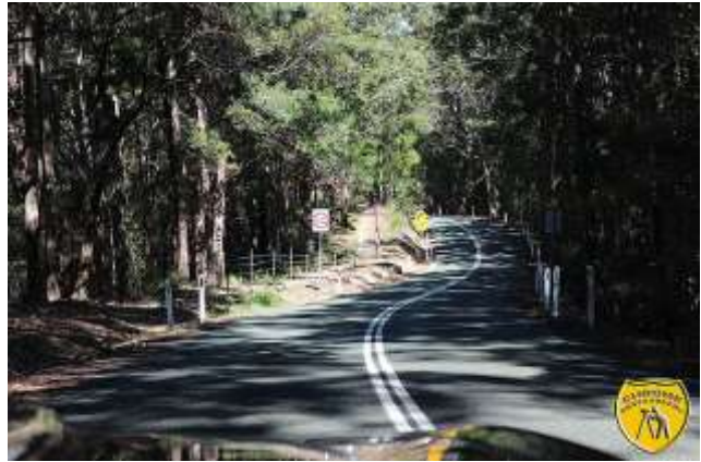
Tomewin Mountain Road in QLD