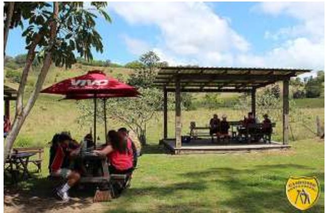
Picnic area at rear