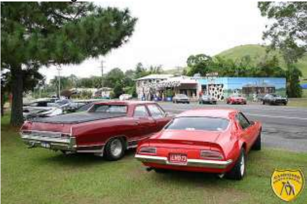
Mooball Roadhouse from opposite side