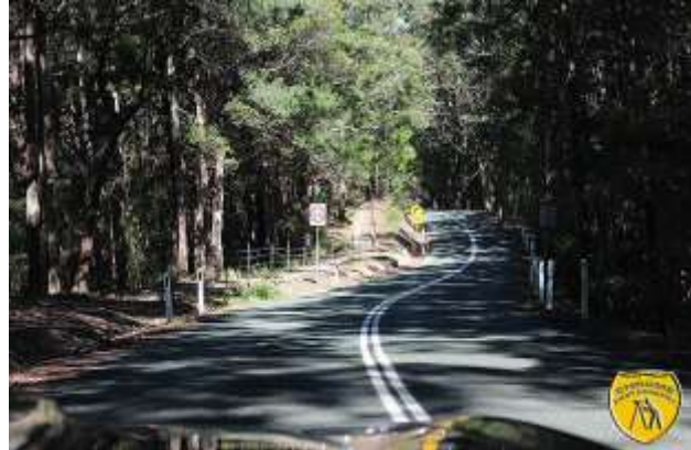
Tomewin Mountain Road in QLD