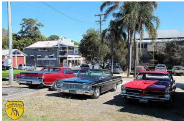
Billinudgel Pub carpark