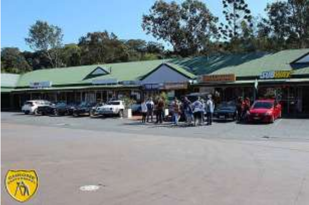
Meet Point West Burleigh behind Caltex