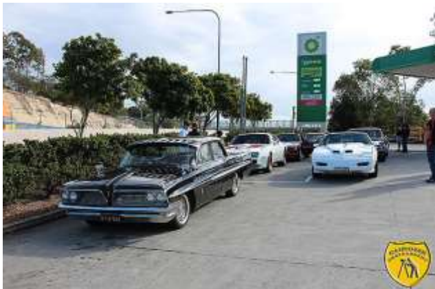
BP Regents Park (assemble at side)