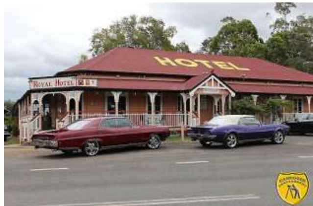
Royal Hotel Harrisville