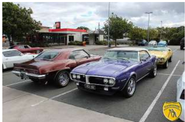
HJ/ Aldi carpark Beaufort