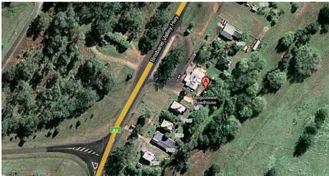
Toogoolawah Roadhouse meet point of two legs