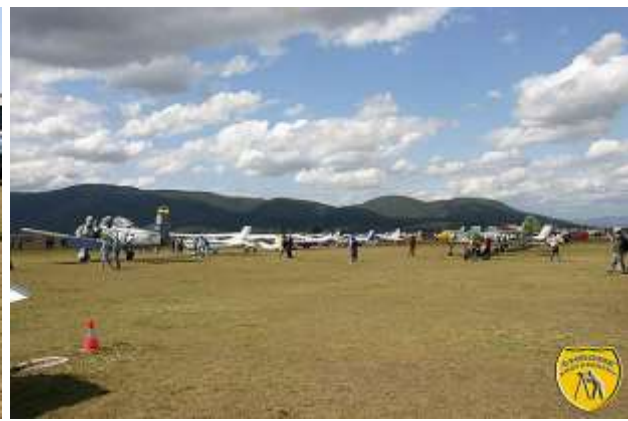
Airshow plane display area