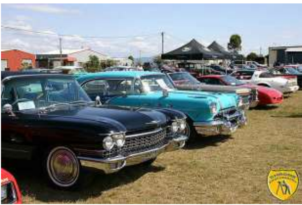
Airshow car display area