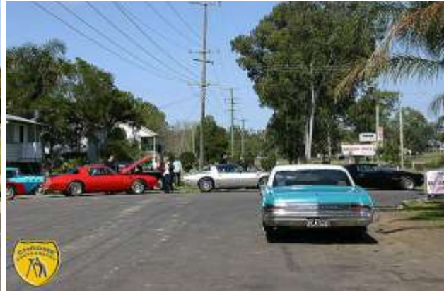
Toogoolawah roadhouse (looking south)