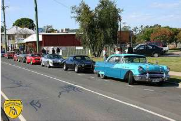
Esk main street