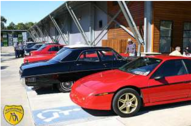
Sirromet down side of cellar door