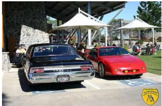
View from same spot, turned to lawn area