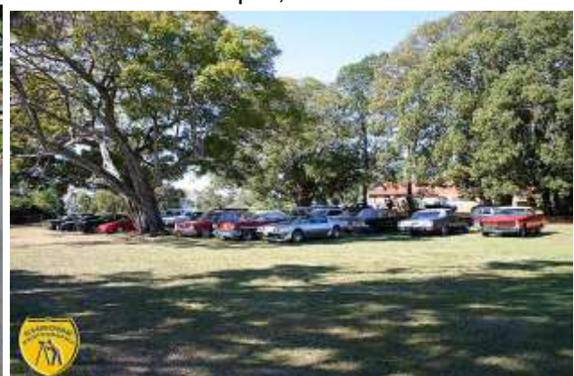
RB Hotel paddock