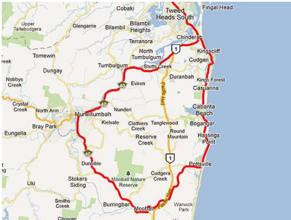
General Map of Loop