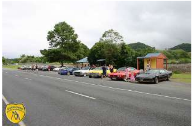
Mooball opposite side parking