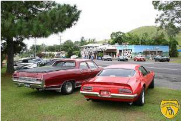
Mooball Café from opposite side