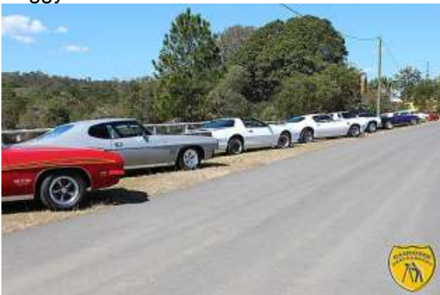
Park on street extension