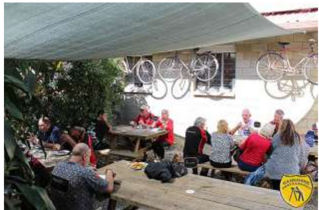
One of the reserved areas, beside stage