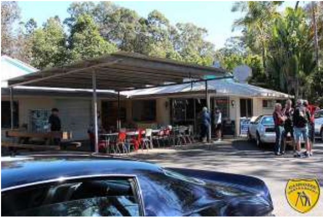
Peggy Sue's Diner