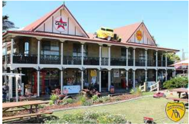
Hell Town Hotrods