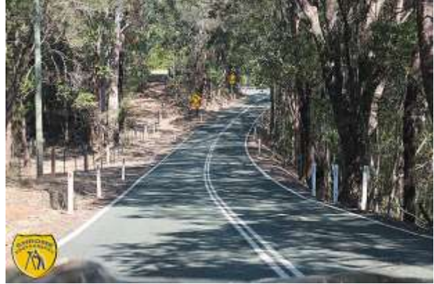
Tomewin Mountain Road in QLD