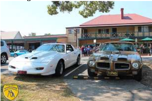
Some parking opposite