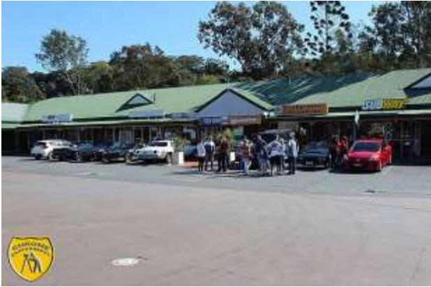
Meet Point West Burleigh behind Caltex