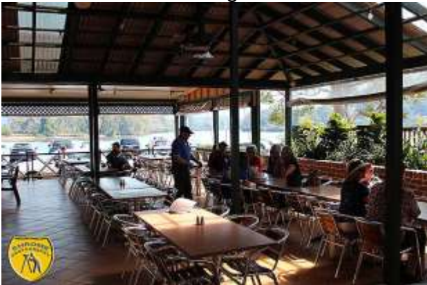
Tumbulgum Pub inside