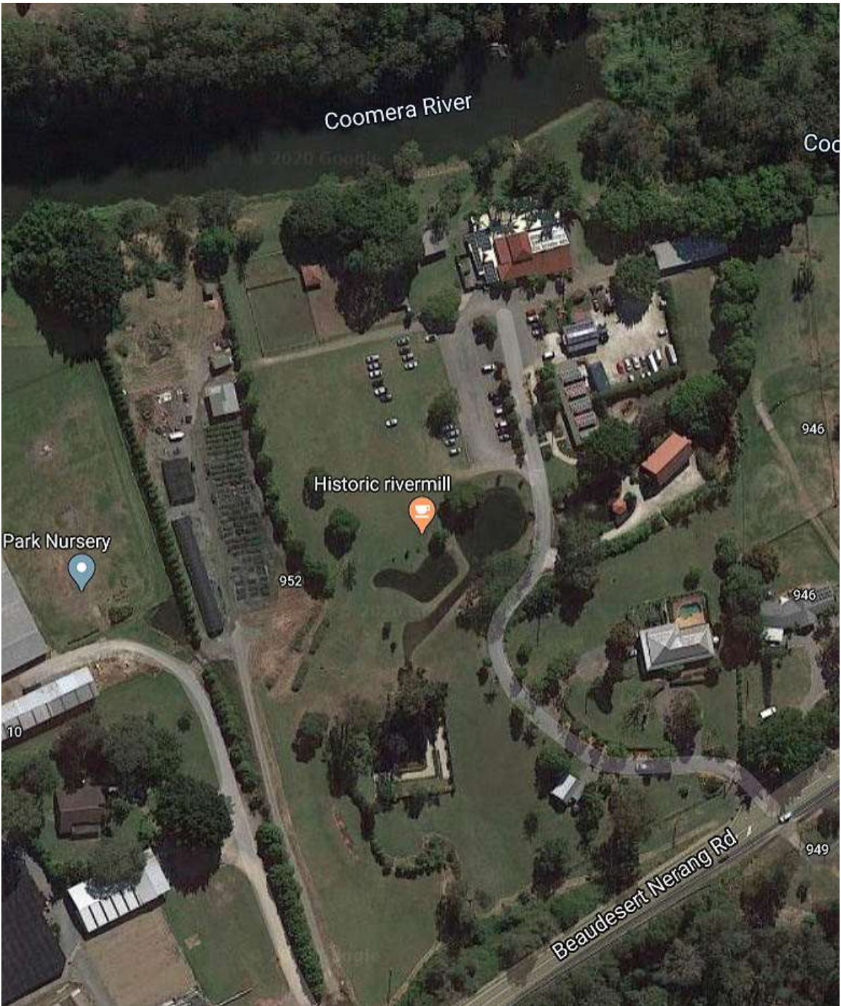
Aerial view of site showing driveway and parking