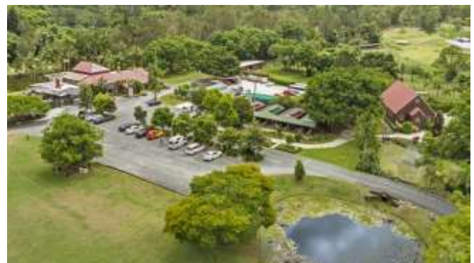
Historic Rivermill and carpark