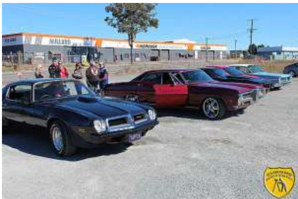
Yatala Pies meet point