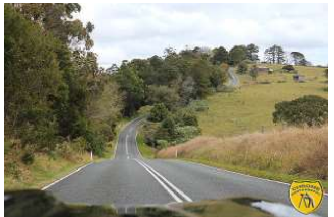
Stanley River Road south of Maleny