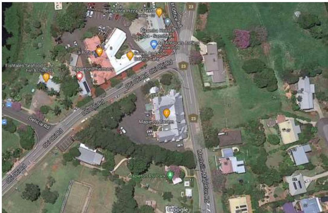
Mapleton showing pub and parking around back