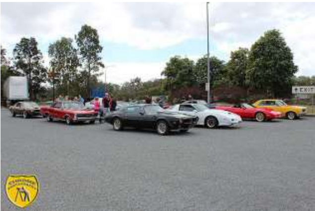
Burpengary meet point