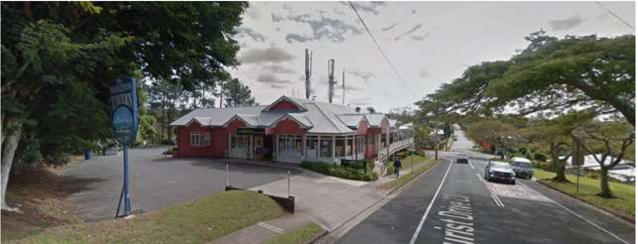
Street view showing entry off Montville Road. This part of the parking area was full on the day we visited, but further around had enough room