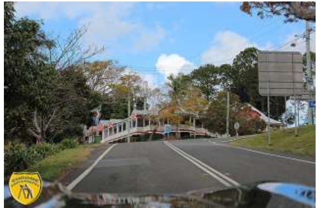
Arriving at Mapleton, veer left