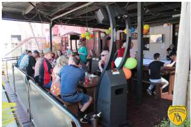
Hotel Deck area