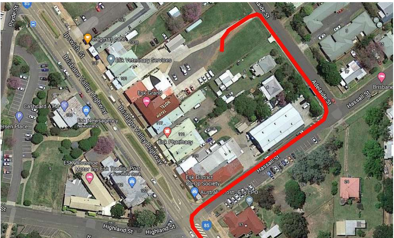
Esk Grand Hotel Parking