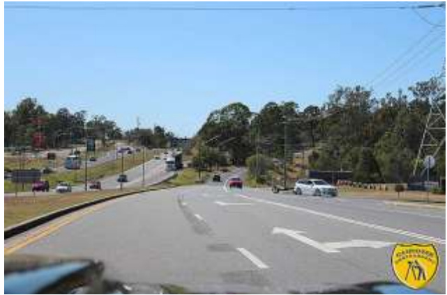
Service road return to overpass on ramp