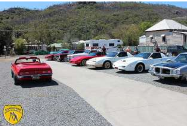
Grand Hotel carpark